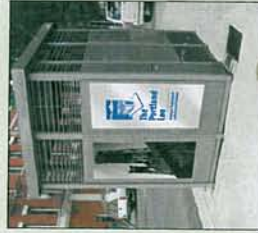
Space available on exterior rear panels for graphics or advertising