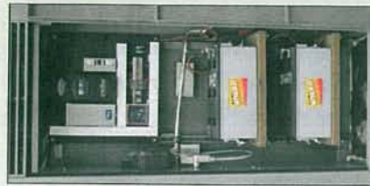
Solar mechanics accessed through rear panel